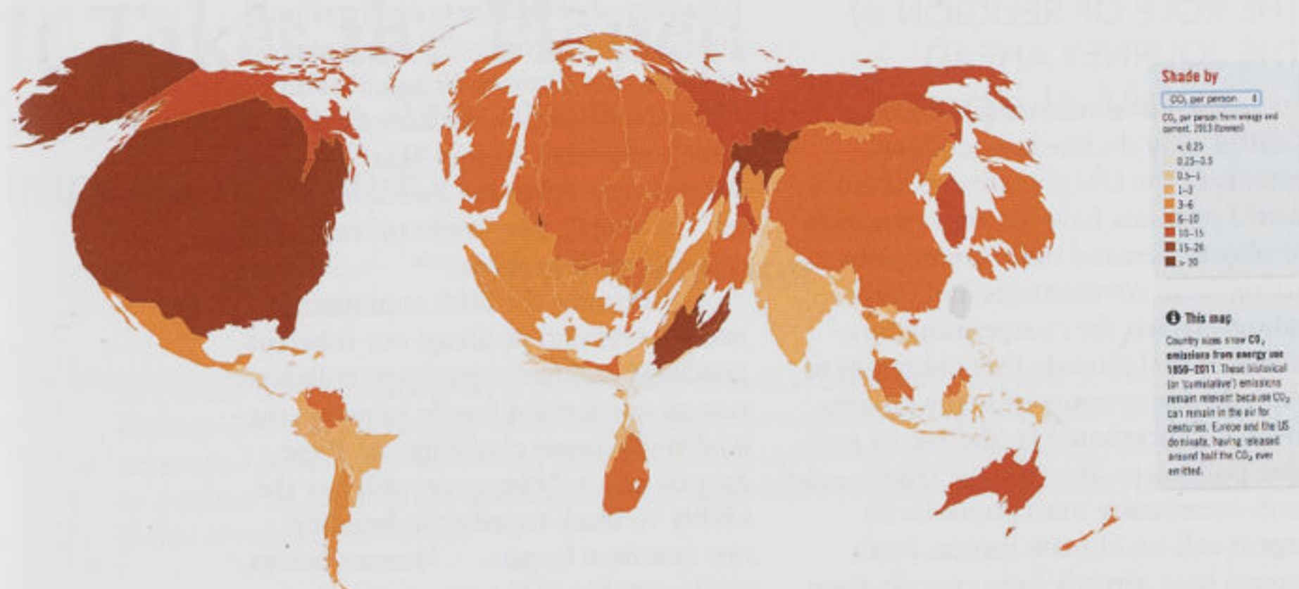
Cumulative CO2 emissions (1850–2011), shaded by CO2 per capita (2013). Source: CarbonMap.org 26

extreme weather events like floods and hurricanes, increasing water scarcity, reductions in crop yields, and rising sea levels that impact coastal cities. Tropical countries share the commonality of being among the world’s poorest while also being the most vulnerable to climate change, as illustrated in the map below.