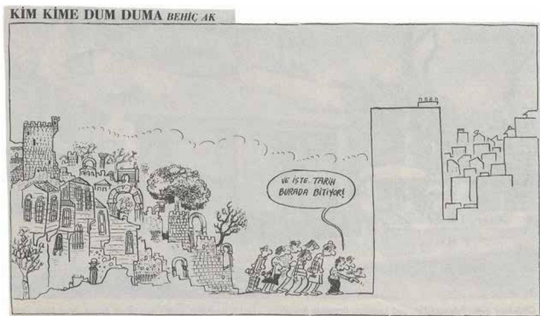
Behiç Ak, Cumhuriyet 10/29/88. Reprinted with permission of the artist.