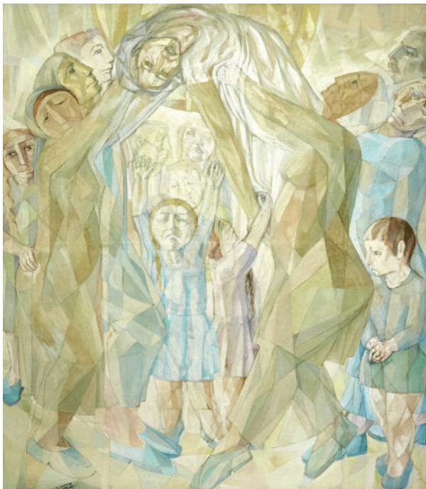
Leila Nseir (Syria, b.1941) The Nation, 1978, oil on canvas, 160 x 140 cm. Collection of Barjeel Art Foundation, Sharjah.