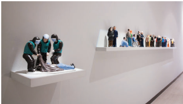
Moataz Nasr (Egypt, b.1961)

I was certainly caught in the moment. I was also on the side of the protesters and remain so to this day. Sadly there is an attempt to re-rewrite the events of the Arab Spring and cast them in a negative light, while in reality, the negative aspect was the violence that was meted upon the protesters. In