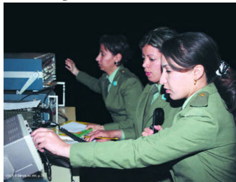
Women working on switchboards.

An exception was found in a special April 2013 issue for women's day titled "PNA: History and Memory of the Fiftieth Anniversary." There is a woman in military fatigues (land army) from behind. She is standing up, wearing a helmet, with her long hair visible and tied back. She is holding a rocket-propelled grenade (RPG7). In another picture, titled "Algerian Women: More Than 50 Years of Sacrifices and Abnegation," there is a woman clothed in black and white, most likely a picture from the struggle of independence era. She has a determined look, is seemingly very focused, and is lying on her stomach, holding what looks to be a Vickers-Berthier (VB MKI) machine gun. The main narrative of these rare pictures is to show the ability of women as fighters within the PNA: they can fight, use weapons, and have special skills like men. These representations help negate the army's male-forward, but similarly, emphasize the "hyper-virile" character of the military institution that is and remains primarily male and martial. A contradiction also exists here, as women are attributed certain qualities in the magazine traditionally associated with men, such as bravery, courage, determination, strength, and stamina.