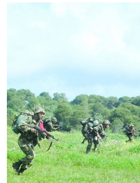
Men in Combat.

the military. The health department employs 17 percent of enlisted women. A substantial portion of enlisted women also work in educational roles as instructors, researchers, or scientists.