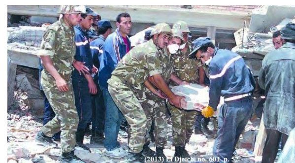
Military intervention after an earthquake.

In an effort to implement the aforementioned decree, the Algerian army established a formal policy framework in 2006 for equal opportunities in the army. The PNA has also made efforts toward recruiting women and acknowledging their right to work within the institution. Practical measures such as maternity leave, retirement, night duties, and extended leave for specific cases