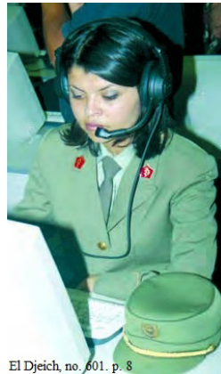
El Djeich, no. 601. p. 8

Despite the unfinished integration, women’s recruitment to the PNA remains a positive accomplishment, specifically in comparison with the army’s previous stance on the issue and when viewing alongside other regional militaries. The PNA has made important and valuable efforts in recruiting women and acknowledging their rights, but their integration into the military remains incomplete. In order to overcome the gap between the discourse of equality and the reality for women in the military, the PNA needs to start regarding and treating women as full-fledged soldiers and equal members of its institution.